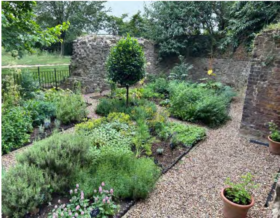
FRONT RIGHT BED

“Bruised and agitated with water it raises a lather like soap which easily washes away greasy spots out of clothes. Applied externally, it cures the itch. The Germans make use of it for the cure of venereal disorders. In fact it cures virulent gonorrhoeas.” (Culpeper)